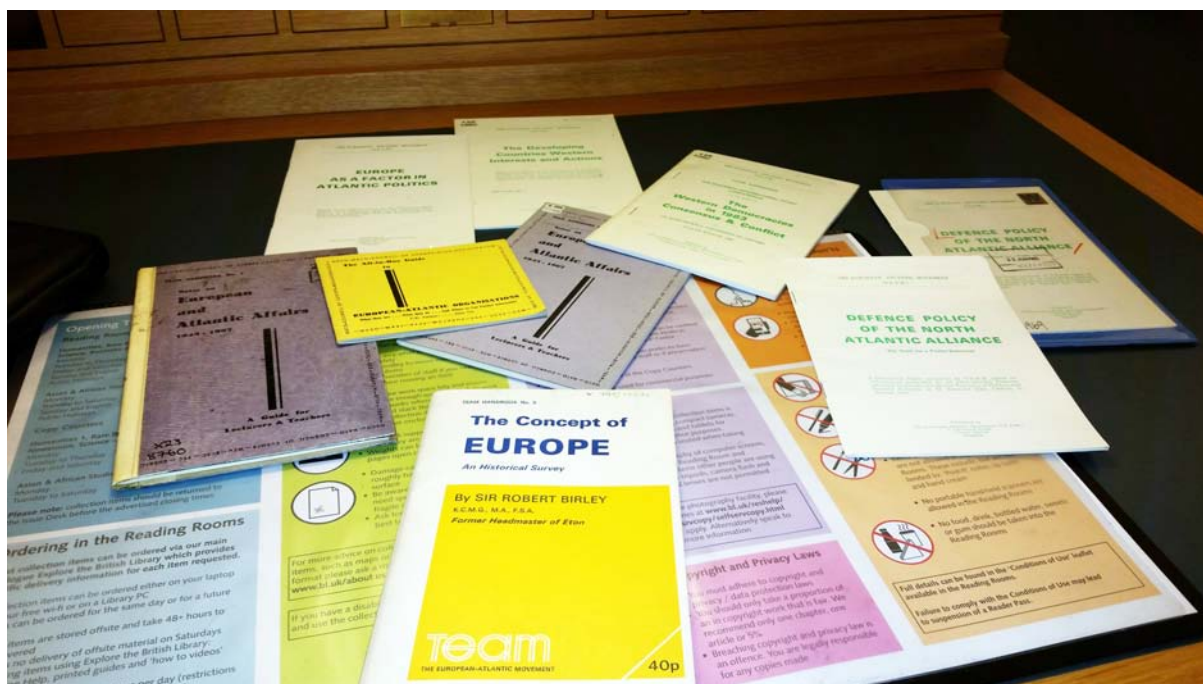
Photograph taken at the British Library Euston, of past TEAM Publications

The history of TEAM will be recounted in successive Newsletters, over the course of 2018