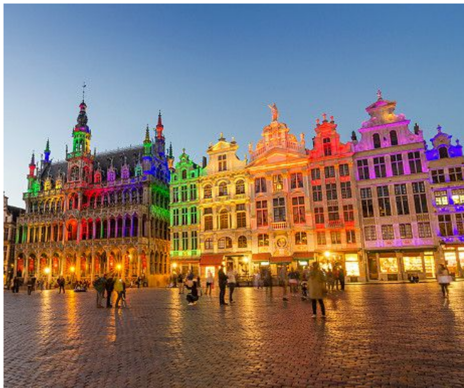
Grand Place Brussels at night