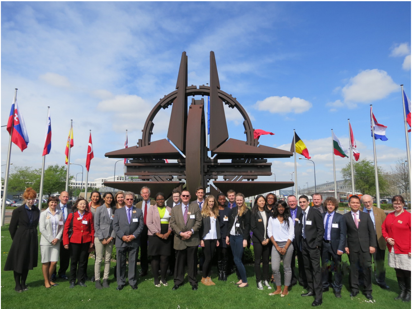
Photograph of a previous TEAM Study Tour to Brussels